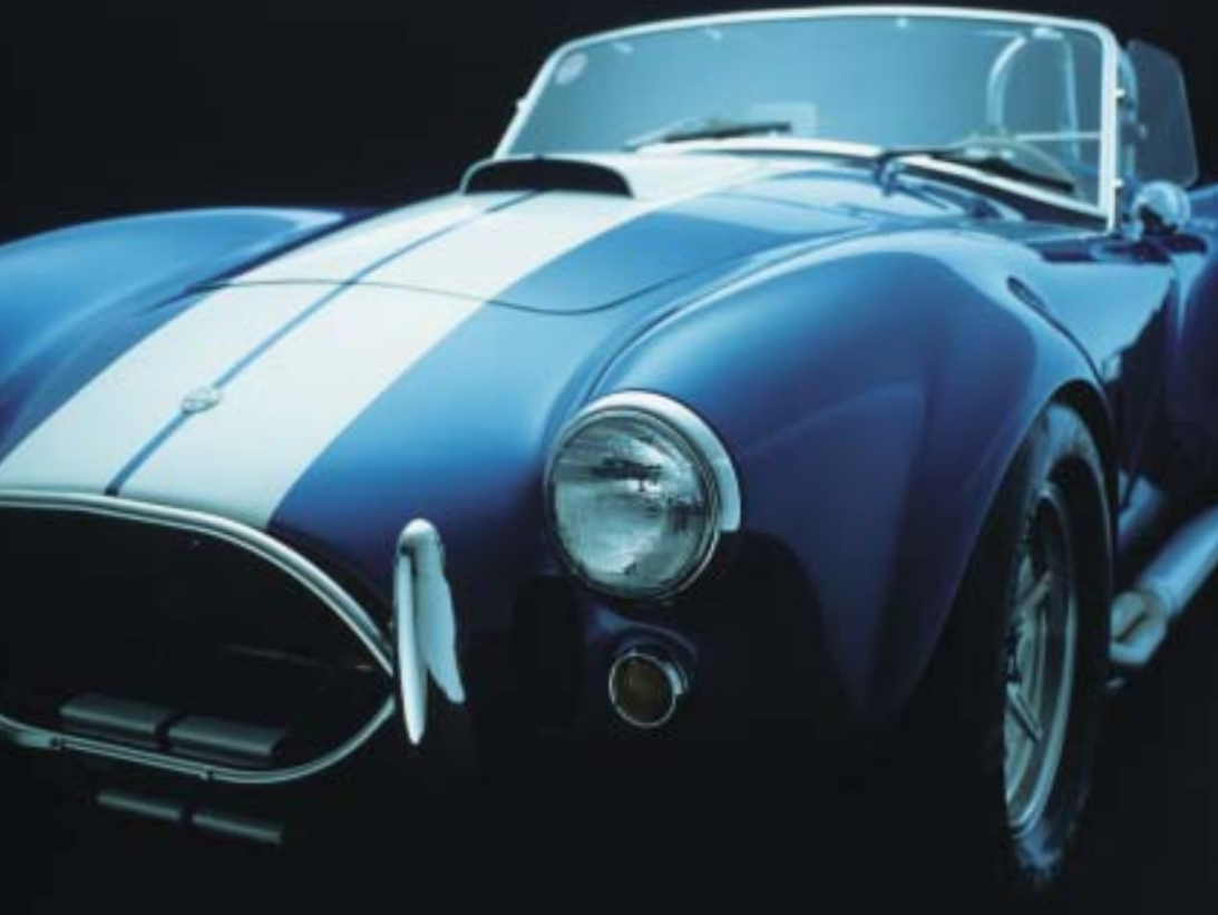
Nikon Scan 4's comprehensive image control options afford you freedom in image quality control and enhancement, helping to ensure high-quality professional printing.

up to 3 frames • Max. total thickness: 2mm