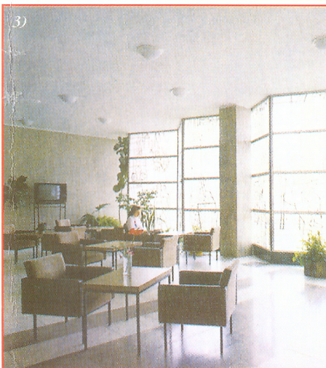
1) The entire view of the Summer Hotel premises